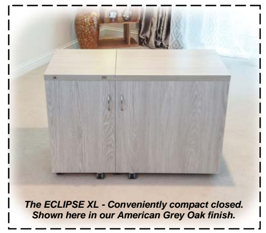
The ECLIPSE XL - Conveniently compact closed. Shown here in our American Grey Oak finish.