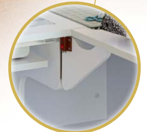
NEW... Extra support arm for the right hand work surface

Fitted with our Horn Maxi air-lifter! (Type 1942) Able to fit the larger, longer armed sewing machines—such as the Pfaff Icon, Bernina 700 & 800 series, Brother V series, Janome Horizon Range and Husqvarna Epic's amongst others but its not just for larger machines its also ideal for all normal sized domestic sewing machines too! (Take a look at page 34 to see how our air-lift works)