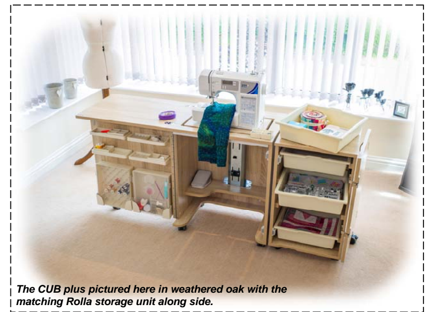
The CUB plus pictured here in weathered oak with the matching Rolla storage unit along side.

NEED MORE STORAGE? You can add a Rolla storage unit to match in with his model!