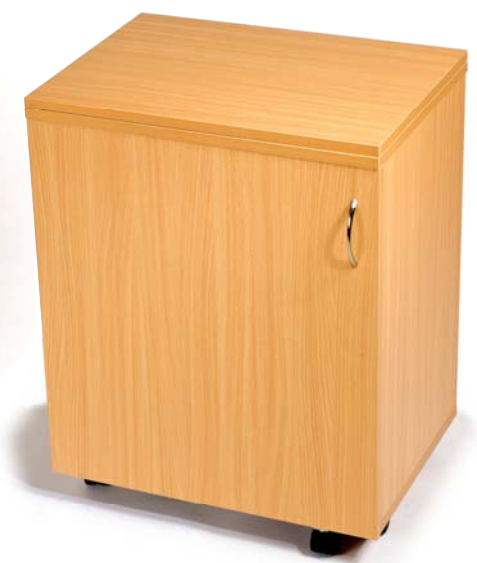
The CUB plus is super compact shown here in Beech

SO COMPACT! Only 2 ft by 1 1/2 ft when closed