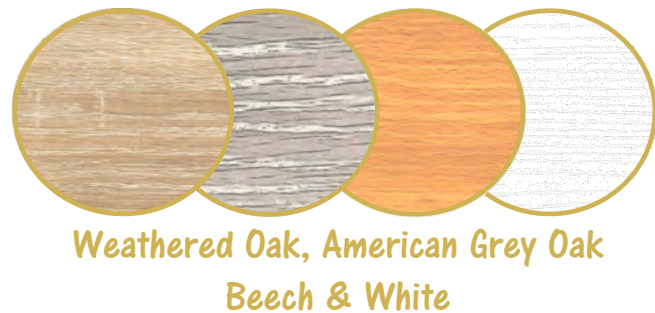
Weathered Oak, American Grey Oak Beech & White