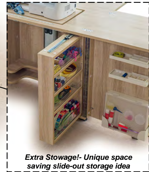
Extra Stowage!- Unique space saving slide-out storage idea

One of our smallest unit to be fitted with our Horn Maxi air-lifter! (Type 1942) Ideal for the new extra large sewing machines—such as the Pfaff Icon, Bernina 700 & 800 series, Brother V series, Janome Horizon Range and Husqvarna Epic's amongst others but its not just for larger machines its also ideal for all normal sized domestic sewing machines too! (Take a look at page 36 to see how our air-lift works)