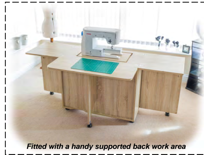
Fitted with a handy supported back work area