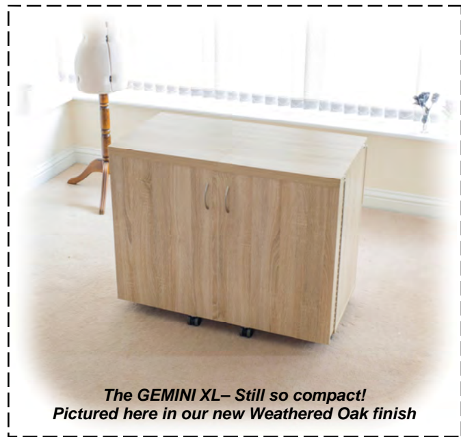
The GEMINI XL- Still so compact! Pictured here in our new Weathered Oak finish

- a great new addition to our compact Sewing / Quilting range