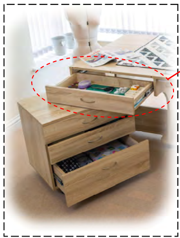
INCLUDED- a slot in filler piece for the top drawer that gives even greater supported work area but more importantly can also be removed if you want to give yourself greater seating space.