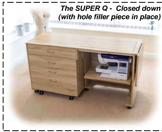
The SUPER Q - Closed down (with hole filler piece in place)

- this will answer all your needs- a truly fabulous unit!