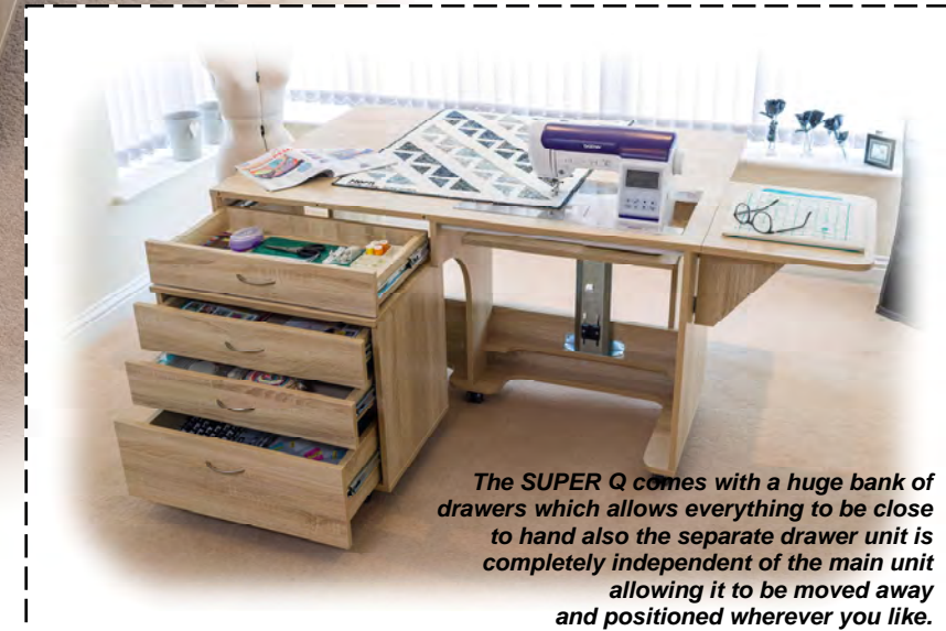
The SUPER Q comes with a huge bank of drawers which allows everything to be close to hand also the separate drawer unit is completely independent of the main unit allowing it to be moved away and positioned wherever you like.