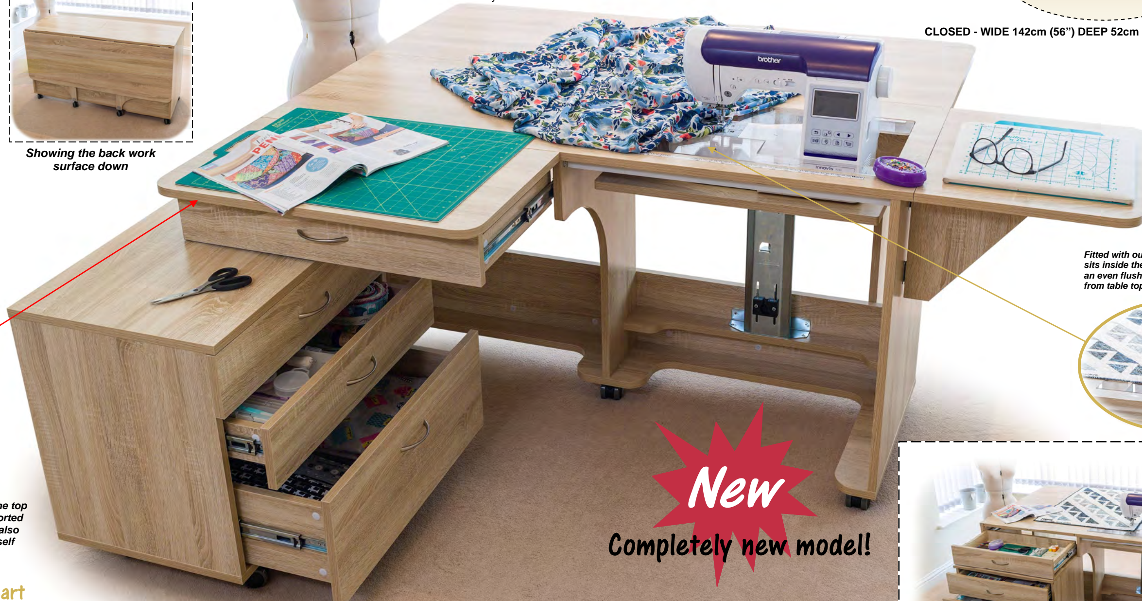
Fitted with our 'inset' design where the inset sits inside the aperture on a ledge thus giving an even flusher, smoother, sturdier surface from table top to machine arm.... You'll love it!