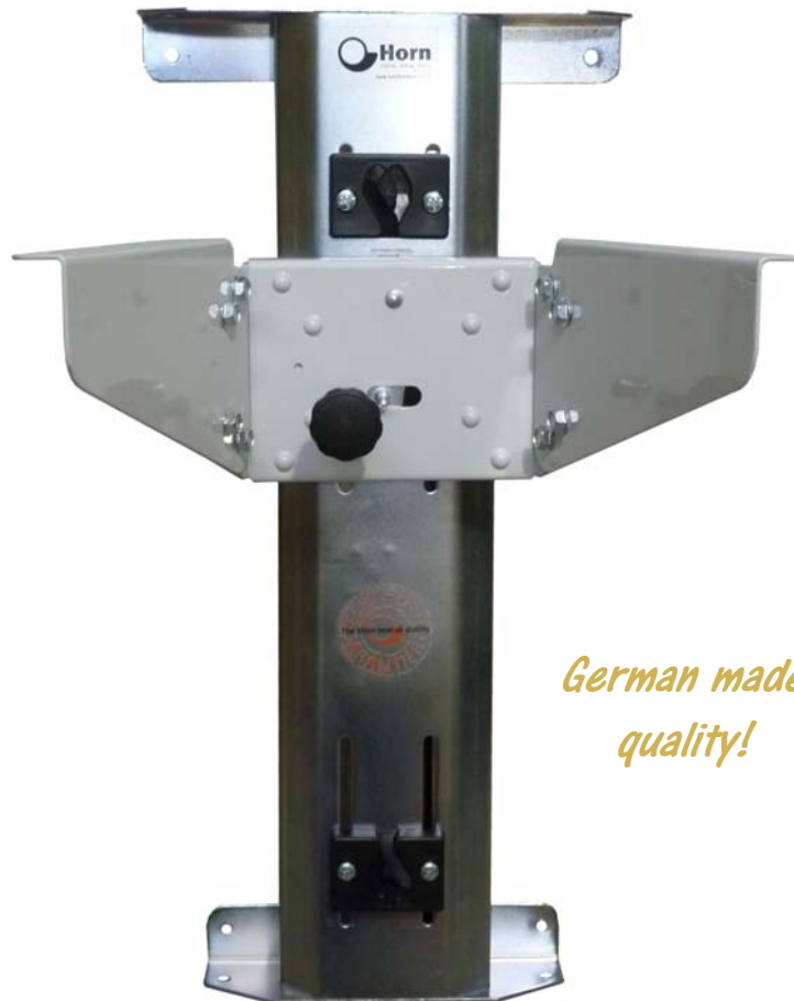
Sewing machine air-lifter front shot