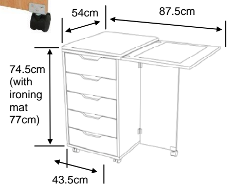
CLOSED - WIDE 43.5cm (17¼") DEEP 54cm (21¼") HIGH 76cm (30¼")