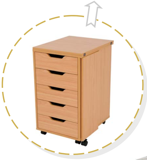
Closed the Deluxe 5 Drawer Rolla Station is compact enough to fit in anywhere.