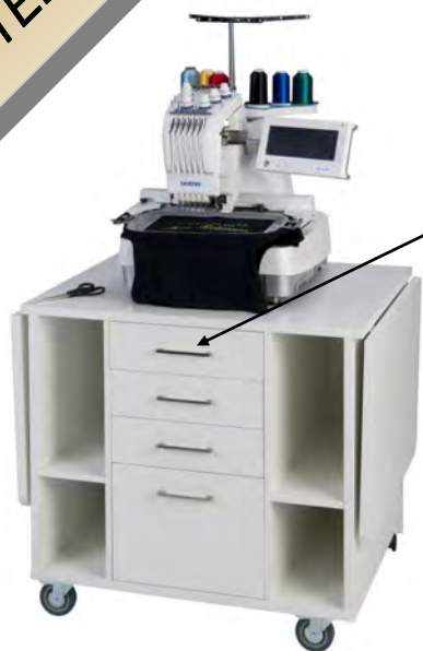
The STELLA Mk2 (Closed)