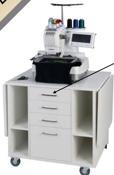
The STELLA Mk2 (Closed)