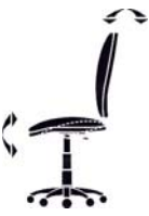
3 lever adjustment