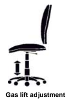
Gas lift adjustment